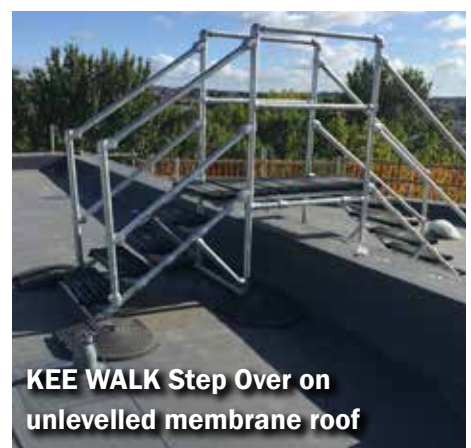
KEE WALK Step Over on unlevelled membrane roof