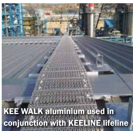
KEE WALK aluminium used in conjunction with KEELINE lifeline

Can be used in conjunction with other products to provide a complete fall protection plan.